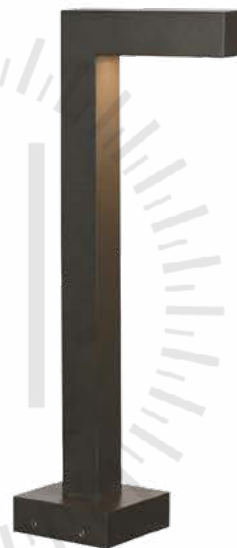
STRUT PATH shown in bronze