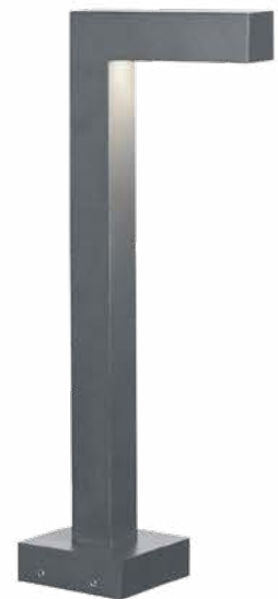
STRUT PATH shown in charcoal